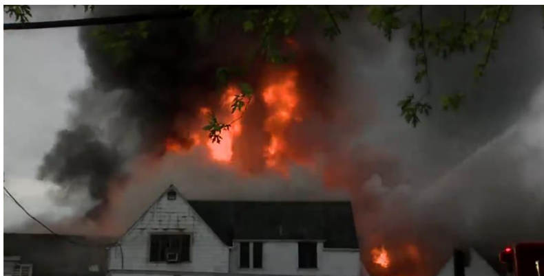
Western Golf & Country Club blaze

In the two years since the last Fifth District Convention, five Sons of Norway lodges in the district have disbanded or are in the process of doing so. This includes lodges near Duluth, MN; Rhineland, WI; Manitowoc, WI; Fort Wayne, IN; and Chicago, IL. Thankfully, all of these lodges except Fort Wayne, IN, are in areas well-served by other nearby lodges, some in the same city.