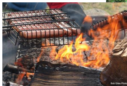
Last year's Viking Hike and hot dogs

Please bring side dishes or desserts to share and lawn chairs.