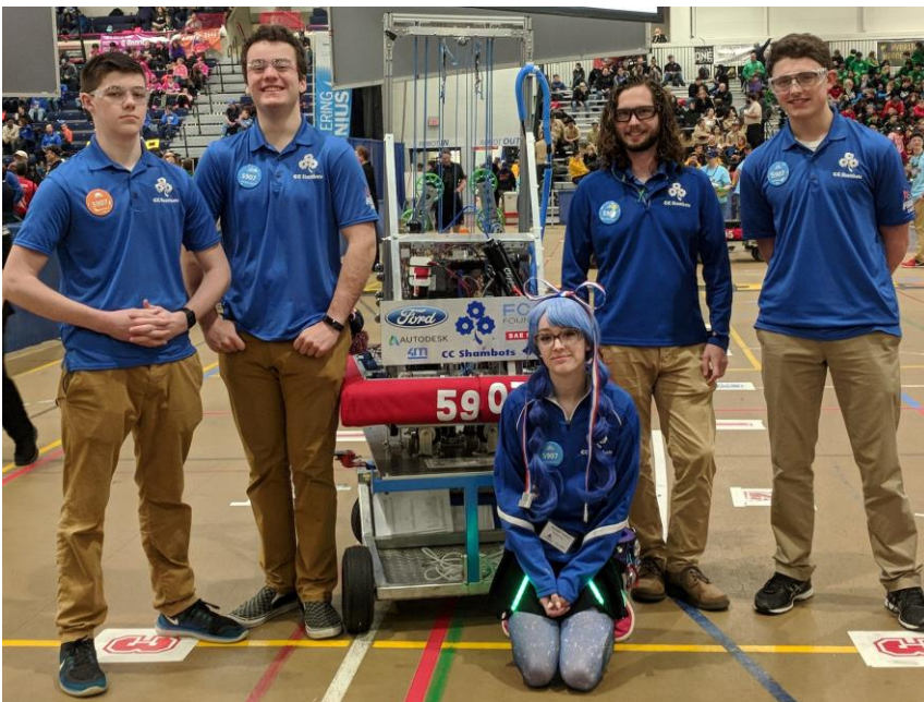
CC Shambots robotics team