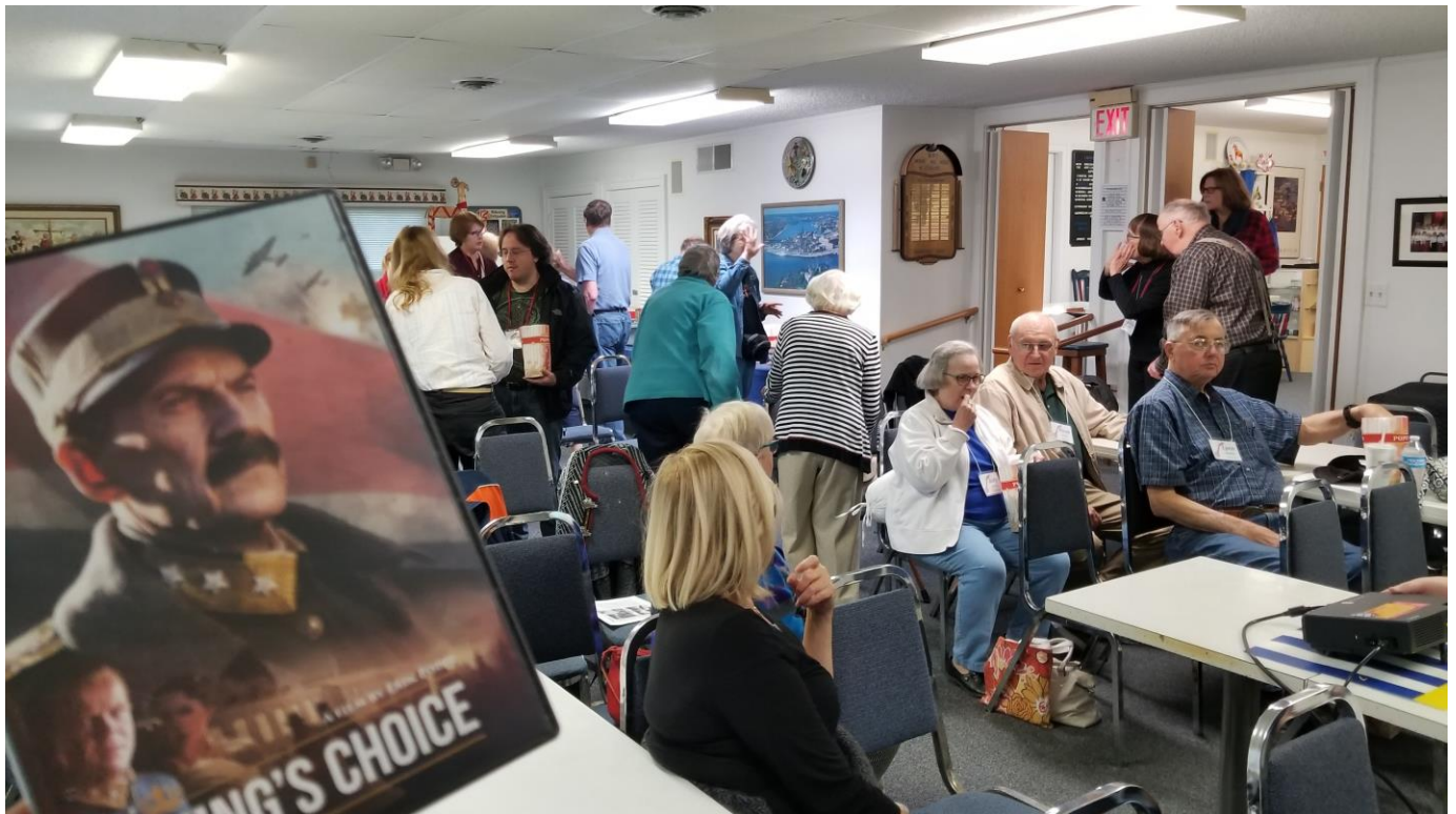
The audience gathers with popcorn and soda for viewing “The King’s Choice.”

The movie riveted the audience’s attention. Afterwards, many enthusiastic viewers said they were looking forward to the next movie night.