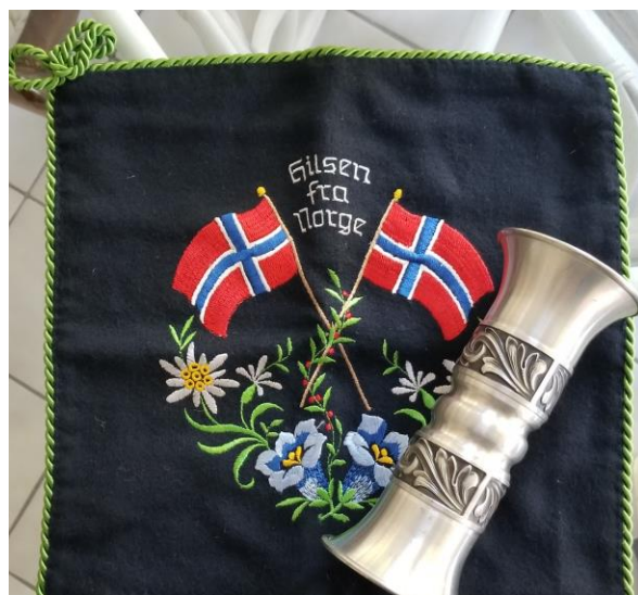
Two items given for this year's auction: Embroidered pillow cover and pewter candlestick

All auction proceeds go to the Nordkap Scholarship Fund. With our five scholarships this year, next year's fund will need extra support. Please bring your items to donate to our October or November meetings.