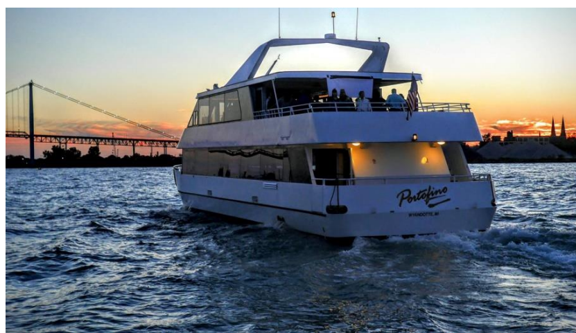
MV Portofino (Portofino photo)

The journey, from Wyandotte to Detroit and back, should help launch Nordkap on