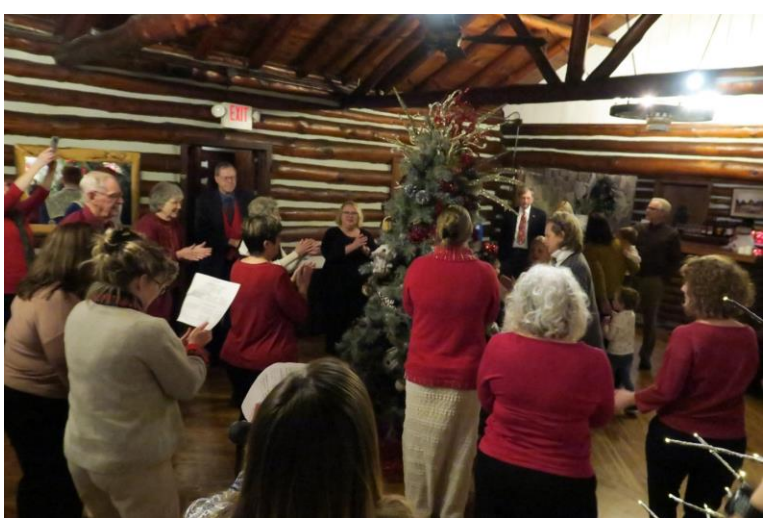
Traditional dancing around the tree