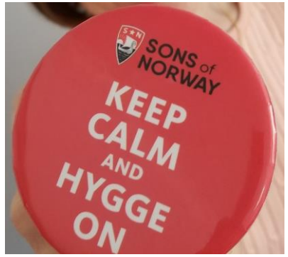
Advice from the Sons of Norway