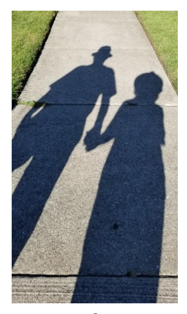
Are we there yet?

Carol says that the cumulative miles reported by our members to date show our lodge has already passed the halfway point to Norway. A total of 4700 miles is required, and we had 3400 as of August 27.