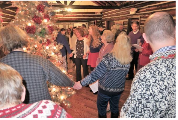
Wait until next year when festive Christmas celebrations like this one in 2019 will resume.

Please note: We have reserved NEXT YEAR'S date of December 12, 2021, at the Fox Hills Golf and Banquet Center in Plymouth, for our next Christmas party. Fox Hills is applying our previous deposit for the cancelled party in 2020 to the 2021 date. We look forward to celebrating Christmas and our Norwegian holiday traditions with you there!