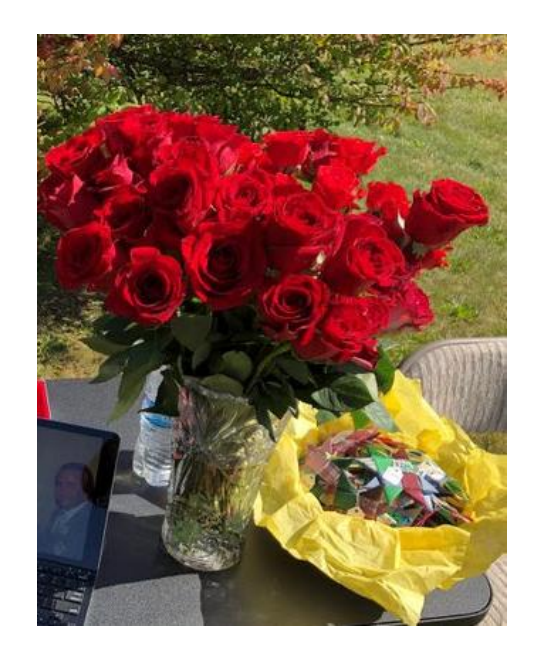
Roses and star ornaments