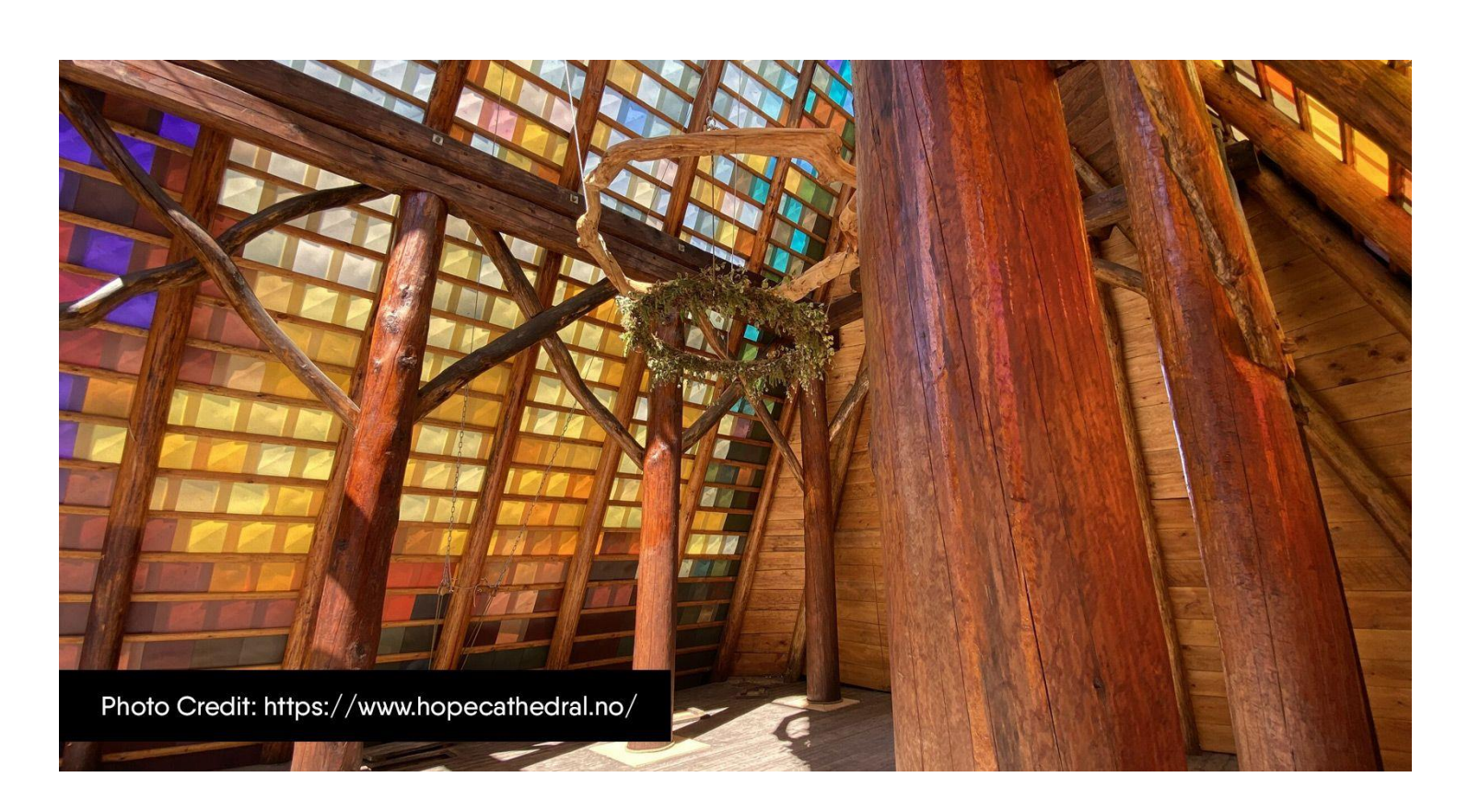
Hope Cathedral in Fredrikstad, Norway, made from timber and plastic fish boxes.

To find out more, visit their website: hopecathedral.no