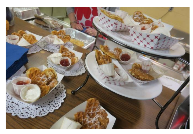
Waffles available in 2019 at Finnish Center kitchen window

continue to offer our traditional Norwegian waffles with sour cream and jam. This service will be available in the main room of the center where the vendors sell their wares. It will be accessed in the bar area, through a window connected to the kitchen.