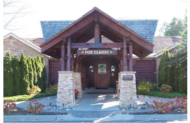
Fox Classic facility at Fox Hills

Due to pandemic precautions and closures, we were not able to hold the party in 2020. But things are now looking up, and Nordkap's Christmas Party Committee is developing plans to return to Fox Hills Golf and Banquet Center in Plymouth for our traditional Norwegian-style celebration.