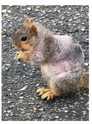
Brownie before (above) and after...