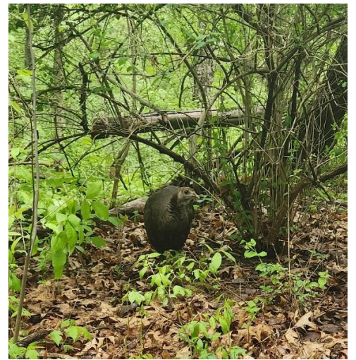
A turkey in the wild