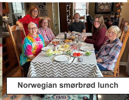
Norwegian smørbrød lunch