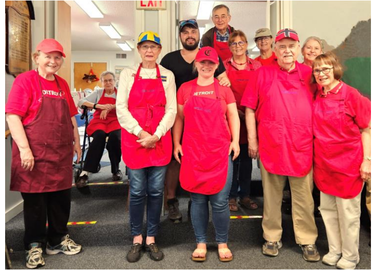
Nordkap Volunteers receive thanks from the Swedes.