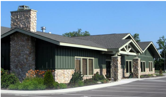
The Kilgour Scottish Center, on the left, will be the location for our December 10 Christmas Party.