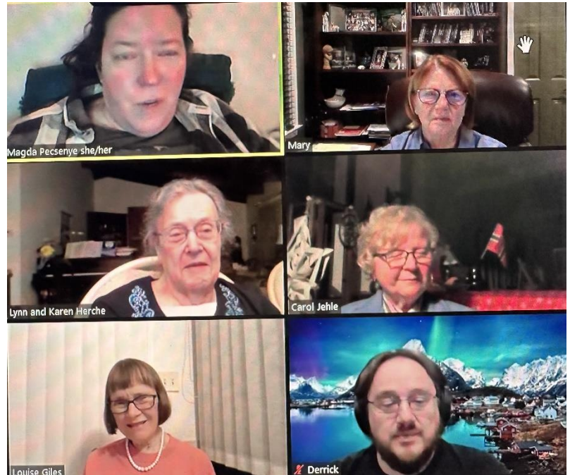
Nordkap Book Club on Zoom