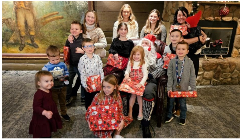
The Julenisse and kids gather before the fireplace.