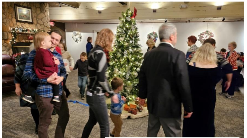
Dancers circle the tree.