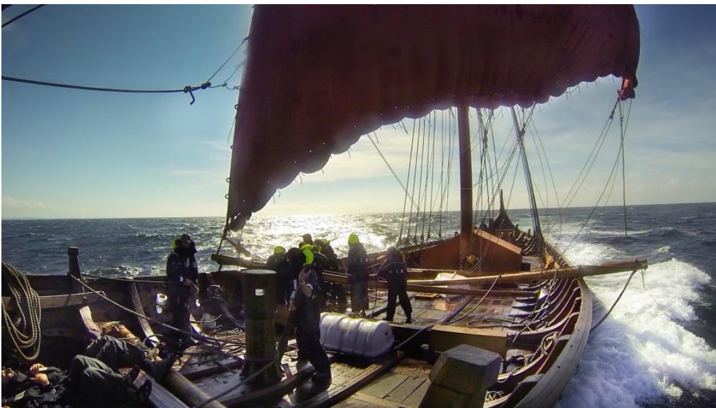
Draken Harald Hårfagre

For more see: http://www.drakenexpeditionamerica.com