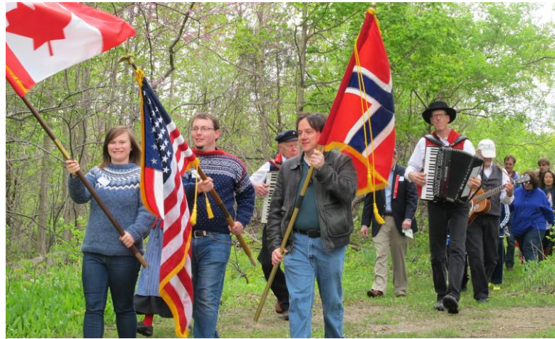
Spirits ran high at last year's Syttende Mai parade.

Be sure to bring your kids, noisemakers, and Norwegian flags (or buy flags at our general store) for the parade around the beautiful Swedish Club grounds.