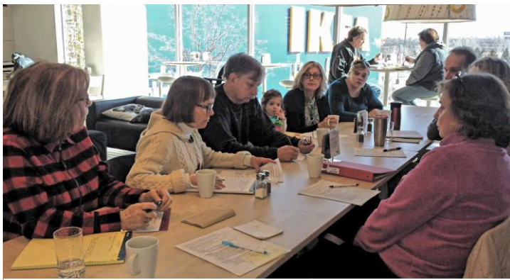
Nordkap Board meeting at IKEA cafeteria