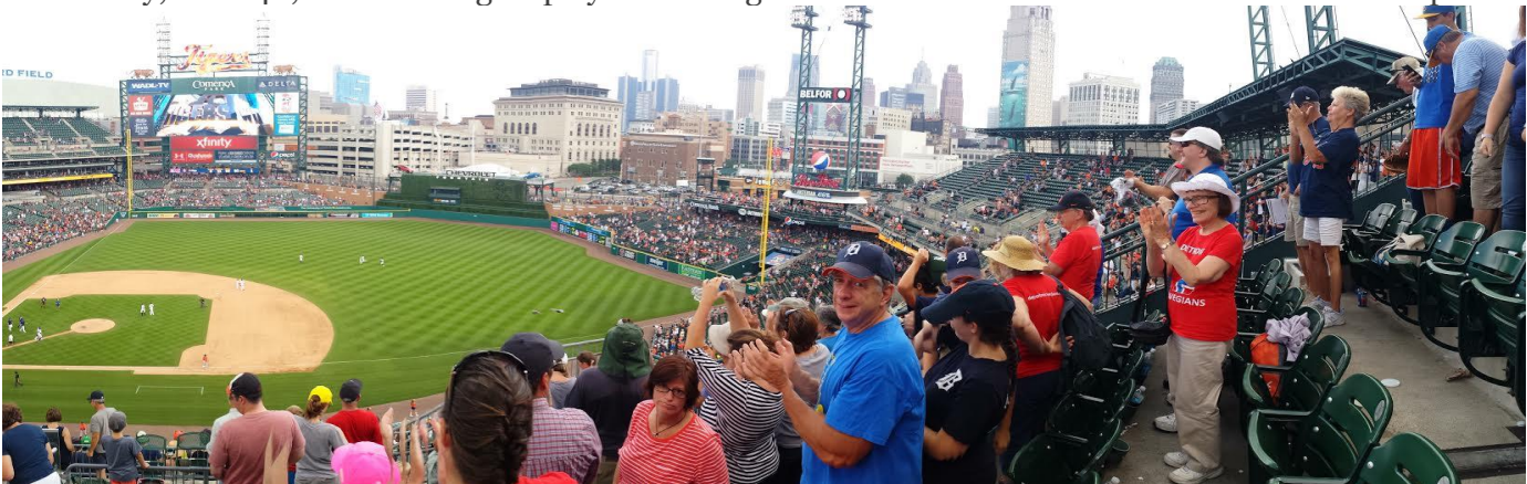
Nordkap joined in cheering the Tigers to a win over the Houston Astros at last year's game.

Back by popular demand, Nordkap’s fourth annual group outing to a Detroit Tigers baseball game has been set for Sunday, June 4 th , when the Tigers play the Chicago White Sox at Detroit’s Comerica Park at 1:10 p.m.