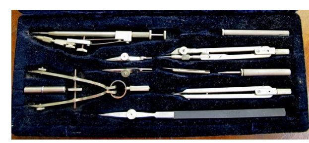
Knut's Drafting Tools

Some books that didn't sell at our silent auction in December were offered to students in Nordkap's Norwegian language class. The students eagerly snapped up several volumes written by Norwegian authors or about Norwegian subjects,