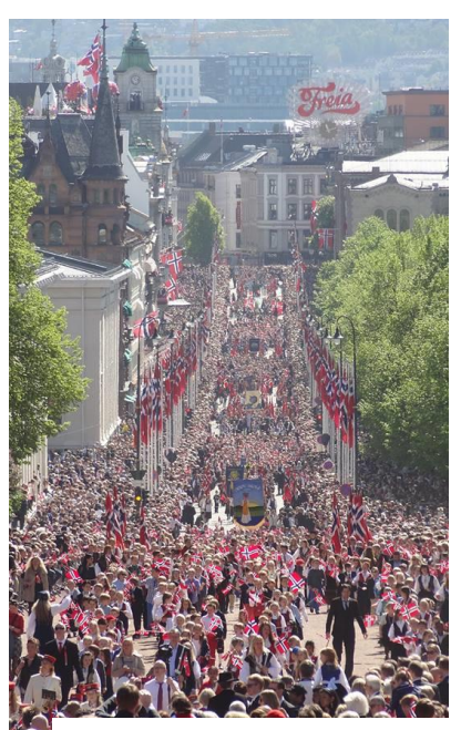
Carl Johan Street in Oslo on May 17, 2014.

The Nordkap volunteers who helped organize our lodge meeting at the Swedish Club last month did a great job and ensured that all who attended had a tasty meal, learned a new craft, and learned how Norway celebrated the 200<sup>th</sup> anniversary of its Constitution in Oslo last year