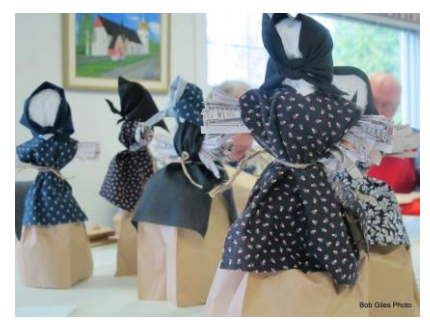
Assembled paper witches

The paper witches will be used to fulfill a centuries-old tradition of keeping the bad away by tossing a paper witch into the bonfire on Midsummer Eve, called Sankthansaften or St. John's Eve, in Norway. Nordkap will hold the event on June 23 at Heritage Park in Farmington Hills.