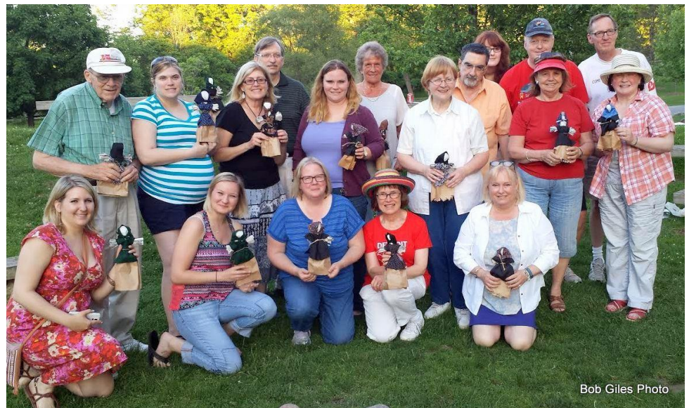
Bob Giles Photo