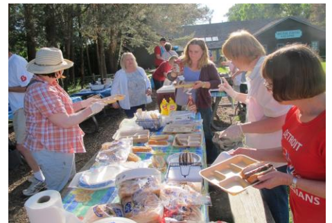
Good conversations, good food, as Midsummer revelers prepare to burn paper witches.