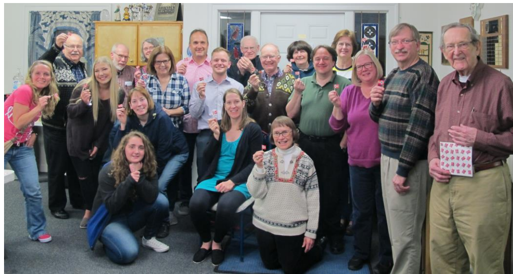
Students hold Norwegian flags at April 27th Norwegian Class