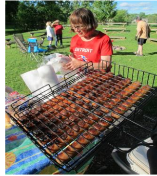
YUM! Grilled hot dogs.

You will find us at Heritage Park at 24915 Farmington Road just south of 11 Mile in Farmington Hills. Meet at the Campfire Ring in front of the Nature Center. Members are asked to bring side dishes or desserts to share and lawn chairs. This celebration replaces our regular June meeting.