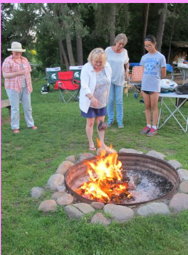
Midsummer 2015