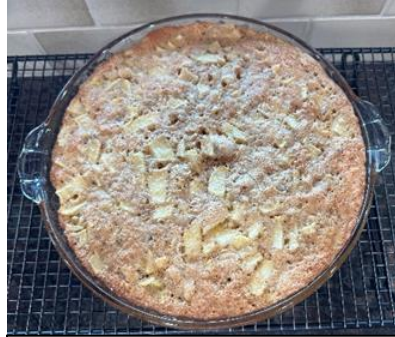
Norsk Eple Pai (Norwegian Apple Pie)