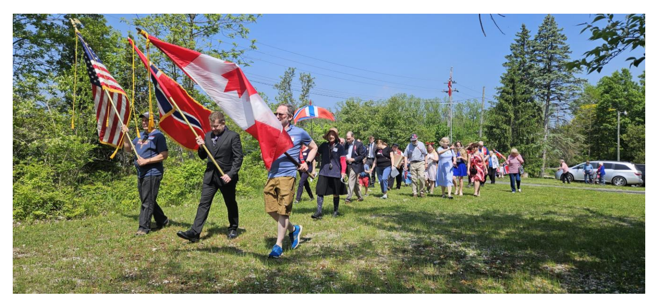
Hearts Fill with Joy on 210th Norwegian Constitution Day

A sun-filled Saturday in May brought our celebration of Norway's 210th Constitution Day to Farmington Hills with many familiar sights and sounds we know so well: